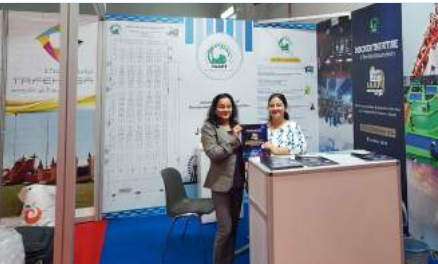
(IAAPI booth at 2023 SEA Expo)